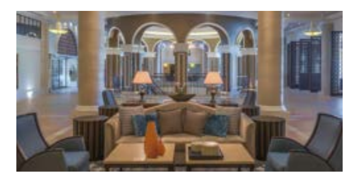
ELYSIUM Unique experiences impress you again and again...