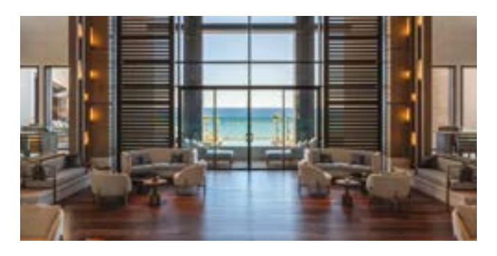
AMARA Elusive, exclusive, eternally yours...